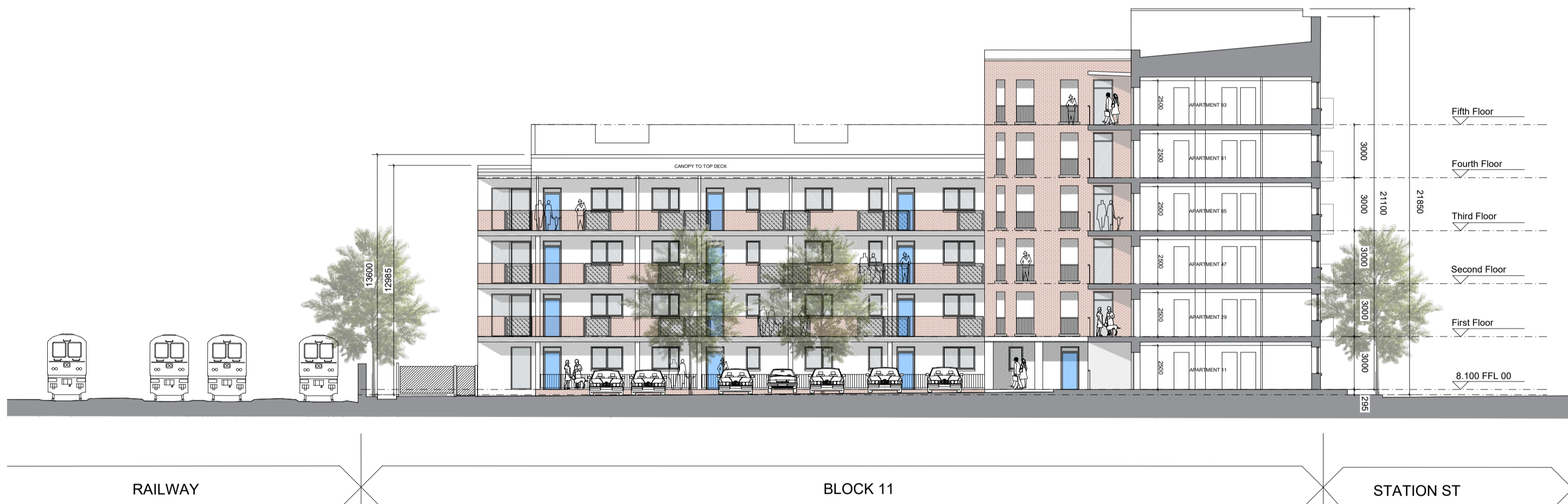
BLOCK 11 - INTERNAL ELEVATION B-B LOOKING SOUTH